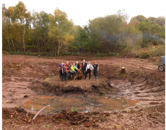
Bromyard Downs: The Butts

One local resident said "it looks like a meteorite has hit the Bromyard Downs". This is quite a normal stage in pond restoration projects. Next spring we will see even more improvements, vegetation will begin to grow as will the number of amphibians and invertebrates. Bird numbers will also increase as invertebrate numbers rise.