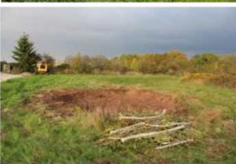
Bromyard Downs: Park Head - before and after

February as most species have left the pond. The good weather in October gave us an opportunity to bring in the diggers and dumper trucks and this meant the contractors were able to progress nicely with the restoration work. So far we have restored 18 ponds. We will have also begun to develop the educational facilities at The Grove - a dipping platform and